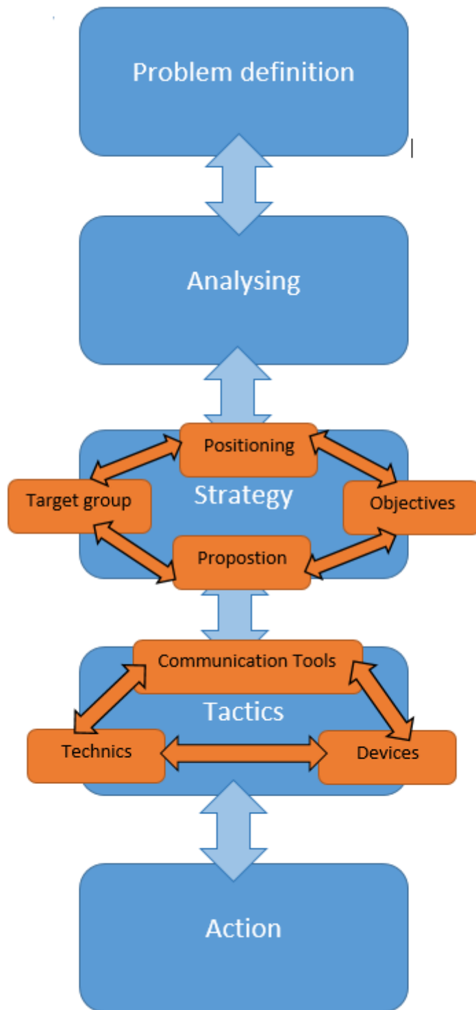
Figure 3 The PASTA method

audience using? Who are involving partners? How is the target group normally informed? What is the target group reading? What are the communications tools and channels they are looking at? The better the target group is known, the better the strategy that can be worked out. Many questions can be answered using desk research. Discussions and interviews with members of the audience or an observation of the target group can also provide a lot of information. A description can be made by creating a Customer Profile, which consist of the "Customer Jobs" (description of what the